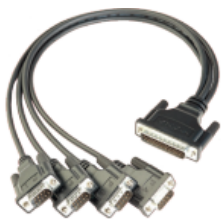
DB44M to DB9Mx4