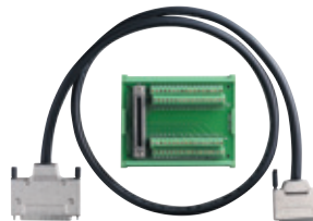
Termination board DIN-68S-01 & 68-Pin SCSI-VHDCI cable ACL-10568-1