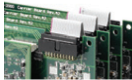
SSI bus cable for multiple cards synchronization

Termination Board with one 68-pin SCSI-II Connector and DIN-Rail Mounting (Cables are not included. For information on mating cables, refer to Section 12.)